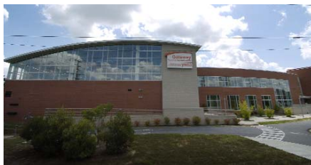
The Gateway YWCA