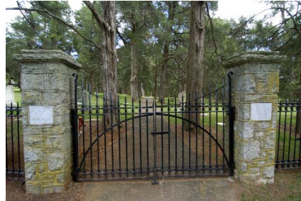
God's Acre, Bethania