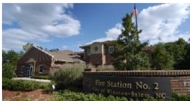
The Winston-Salem Fire Department