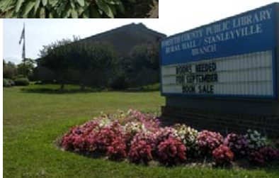
The Rural Hall "Garden Spot of the World" Club