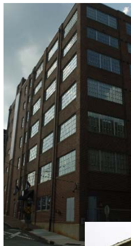
The Gallery Lofts