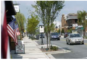
Kernersville's North Main Street Project