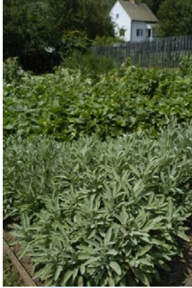
Miksch & Triebel Gardens, Old Salem