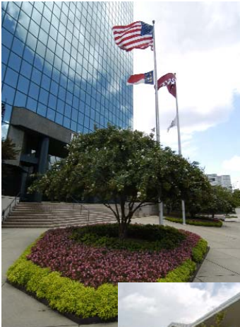
BB&T Building landscaping