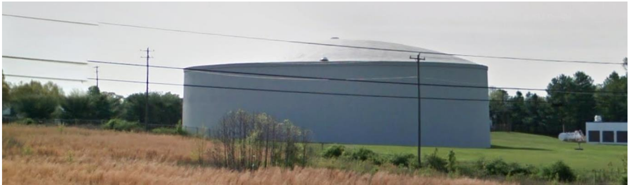
Figure 2. Tank Viewed From Peters Creek Parkway