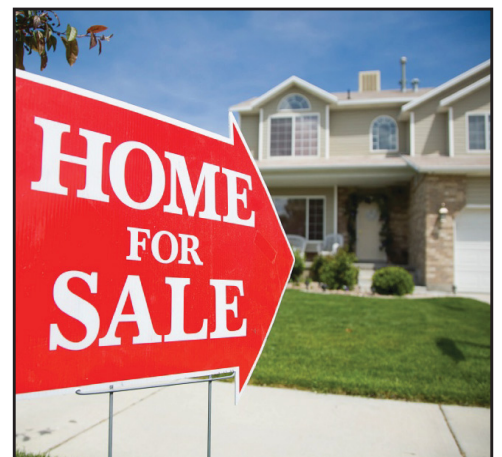
Real estate lead-in (directional) off-premises sign.